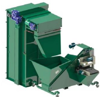
Vertical machine for taller hoppers or space saving