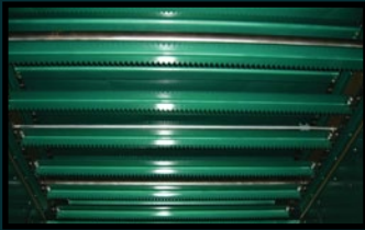
Bale Shaving Head