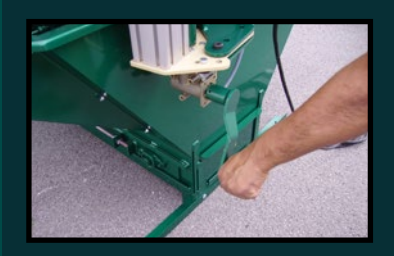
Single Crank Adjustment