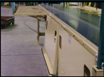
Fold Down Tray Holders