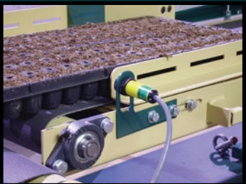
Automatic Tray Feeding