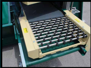
Power pot transfer