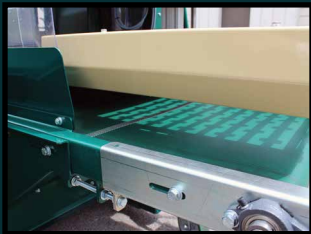
Belt soil return