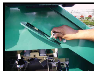
Adjustable soil gate