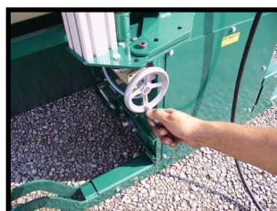
Quick & easy adjustments