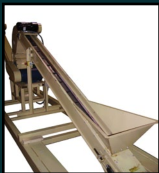
Feeding Coir grinder

Incline conveyor works great with other B&L equipment like the Basic Fluffer