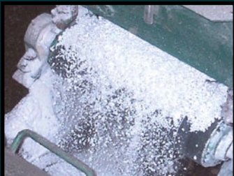
Provides constant flow of evenly mixed soil