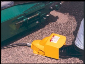
Operator foot switch leaves hands free for bag placement