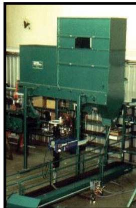
Large 4 cubic yard hopper quickly fills many bags

You can add to your Mulch Bagger or Soil Bagger an even larger system for palletizing bags for storage or shipment.