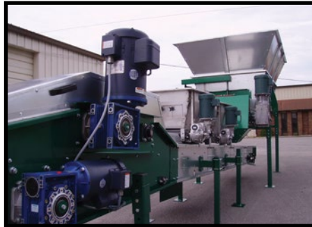
Chemical and Fertilizer Hopper

Model # 12410 (single phase) 12411 (three phase)