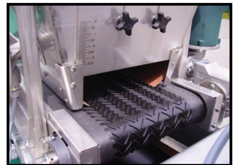
Etched gate setting for single speed unit

The Incorporator or Chemical/Fertilizer Incorporation Unit is designed to blend one or more chemicals/fertilizers into bulk material and or pre-mix for delivery to production equipment. 50 cubic yards per hour is standard but can be expanded with our modular mixing systems to supply required output.