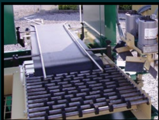
Fold-out brush assembly