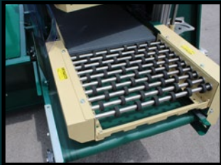
Power pot transfer