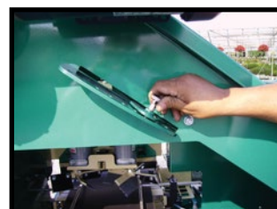
Adjustable soil gate