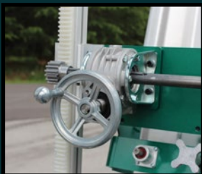
Single crank adjustment