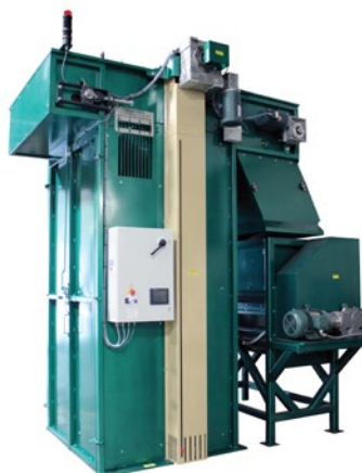
Optional Coir Loader