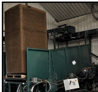
Optional Tip Table