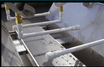
"T" bars standard with interchangeable nozzle system