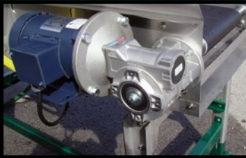
Direct drive gearboxes for low maintenance.