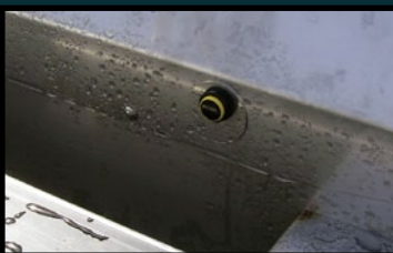
Sensor for auto water start/stop