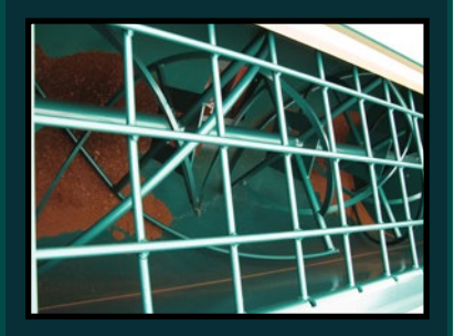
Ribbon blender assures quick and consistant mix