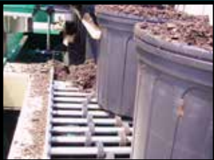
Power pot transfer