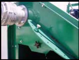
Adjustable soil gate